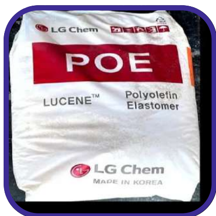
Polyolefin elastomer ( POEs)