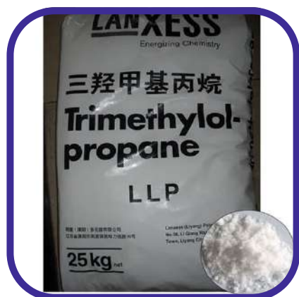
UV Monomers, Oligomers & Photoinitiators