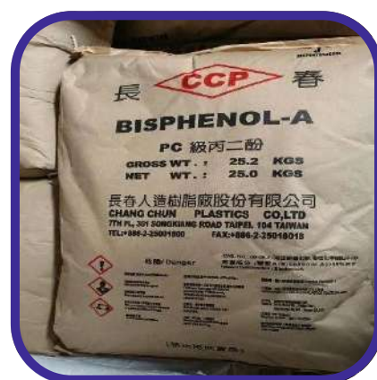
Other industrial chemicals