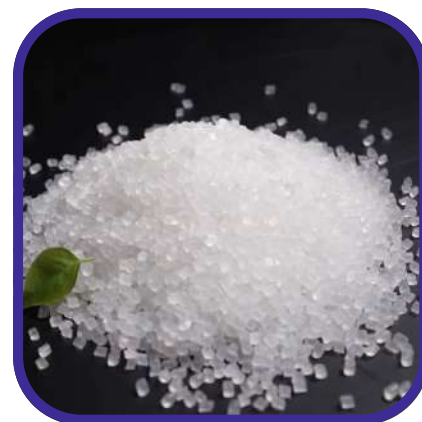
Thermoplastic Elastomers & Resins