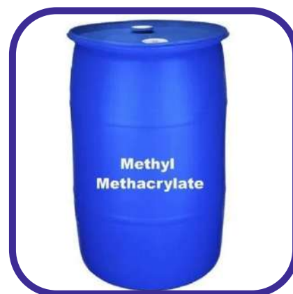
Acylates & Monomers