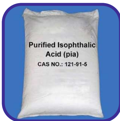
RM For PU