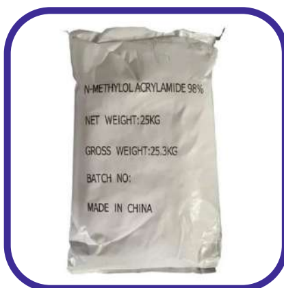
Crosslinkers & Coupling Agents