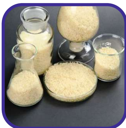
Industrial Gelatine Powder