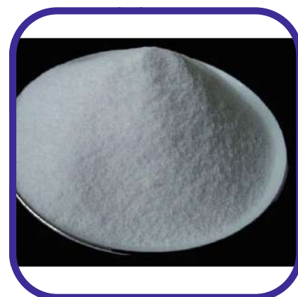
PVA ( Poly Vinyl Alcohol)